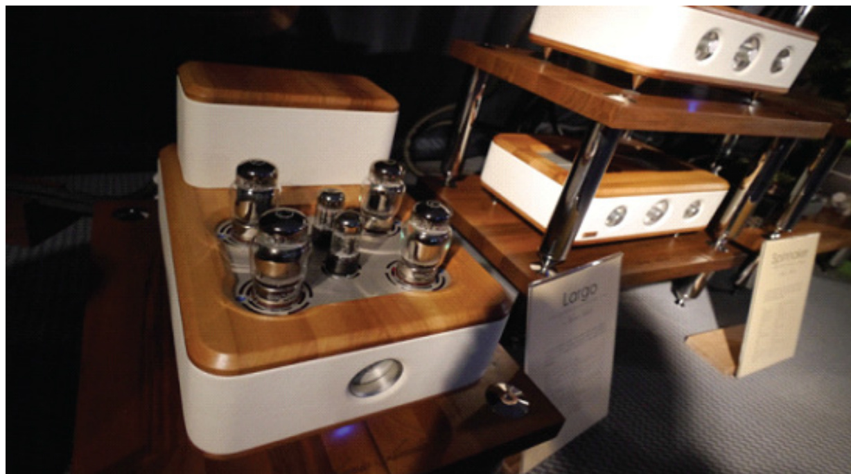
Auris Audio Forte 6550

Warm sound, rendering strings in an organic way