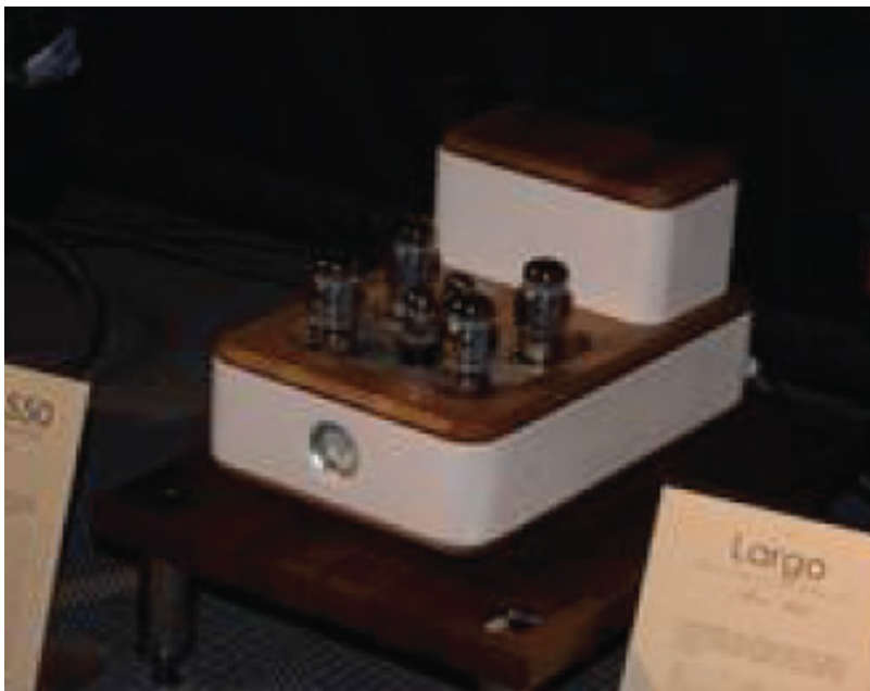
HIGH END SHOW 2014

The same company also displayed the Largo, a preamplifier based on E88CC which is available in two versions, with stabilized power supply and battery.