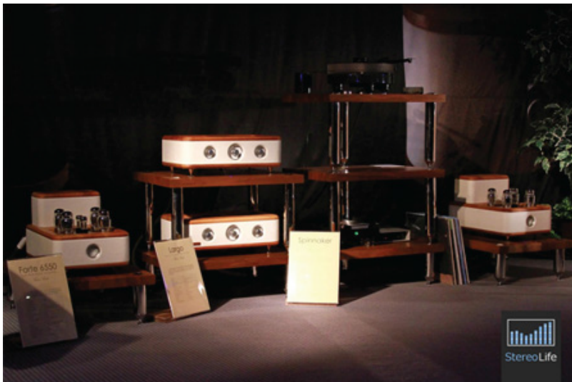
HIGH END SHOW 2014

http://www.stereolife.eu/archive/reports-list/996-high-end-2014-day-three