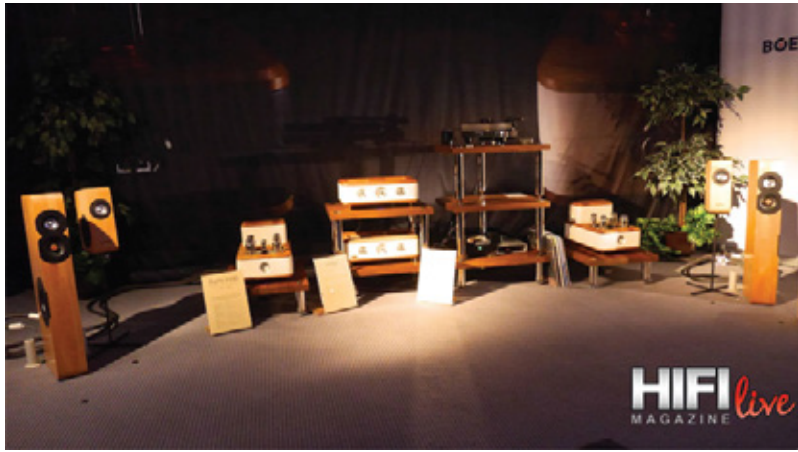
HIGH END SHOW 2014

http://www.hifilive.es/2014/05/21/high-end-munich-2014-2a-parte/6/#