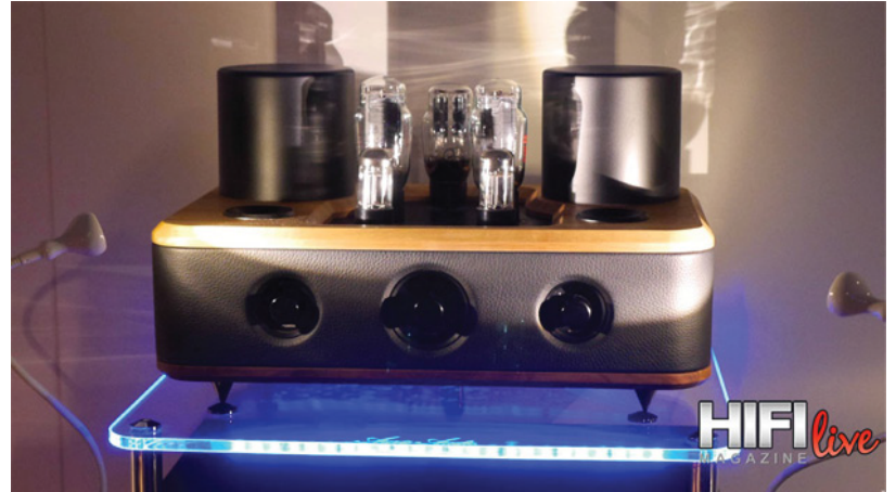
HIGH END SHOW 2014