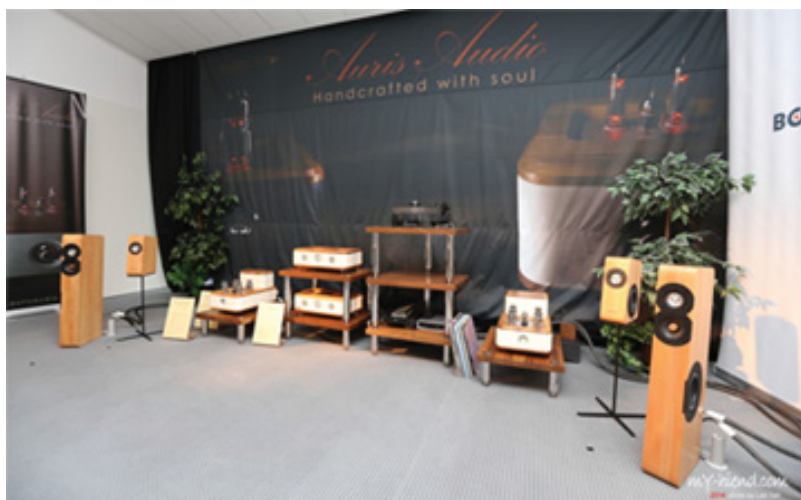
HIGH END SHOW 2014

http://wizard-highend.blogspot.com/2014/05/boenicke-speakers-with-auris.html