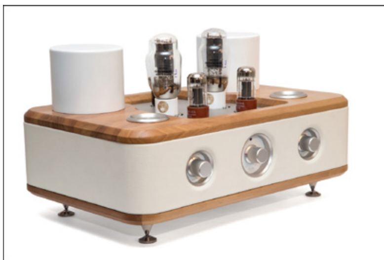
ADAGIO - SE vacuum tube integrated amplifier

"The ideal supplier for the transducer still looks like