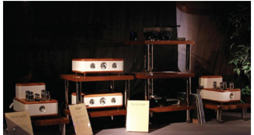
HIGH END SHOW 2014

Among the spinnaker Phonstuf, switchable for MM or MC with transformers for costs 3950 euros. They, too, will be available from October in battery version. The Forte 6550 mono power amplifiers operate at 92 watts linearly from 14 Hz to 36 kHz. Working in her four separate gain stages, two parallel pair in push-pull circuit.”