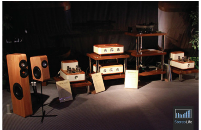
HIGH END SHOW 2014