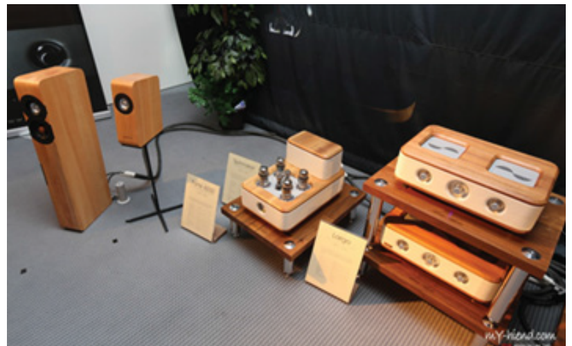
HIGH END SHOW 2014